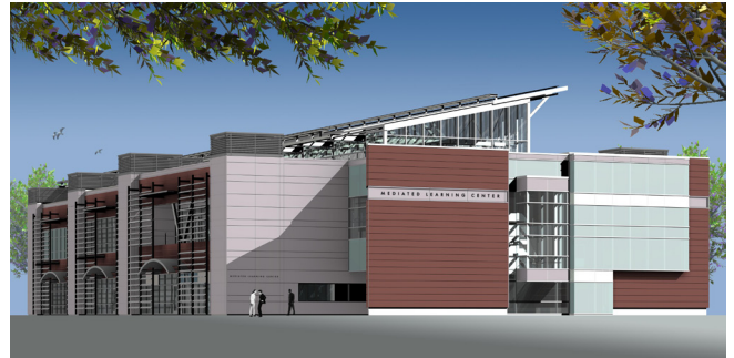
Exterior view of the Mediated Learning Center.

Low-flow plumbing fixtures including 1.28 gallon per flush toilets and 1/8 gallon per flush urinals reduce indoor water use to 48 percent below the calculated LEED baseline. This equates to roughly 117,000 gallons of potable water savings annually.